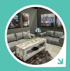
FLOFORM Design Lounge